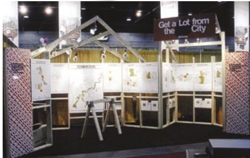
Budgets for exhibits are always tight, especially when city coffers are involved. Sometimes one must get by with just a few spotlights and 2 by 4's, as in this display of building lots offered for sale by the City of Edmonton .