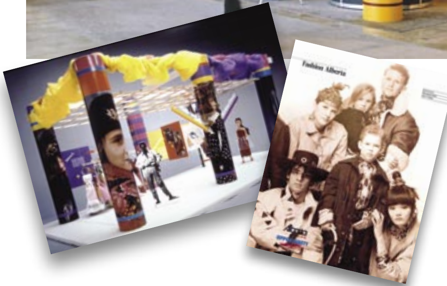
I was pleased to have the opportunity to design the Alberta Fashion booth for a Toronto fashion trade show. I was told that even Alfred Sung noticed our display!