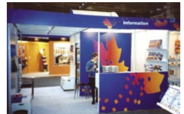
Various configurations of the Canadian booth. Left – typical entrance gate.