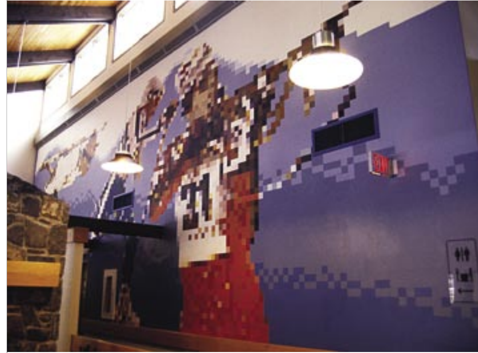
An interpretive wall in the Canmore Nordic Centre , built for the 1988 Winter Olympics in Calgary. Over 8,000 pieces of coloured plastic laminates made up this mural depicting biathletes. In 1987, creating a pixelated image without the aid of a computer was quite an undertaking.