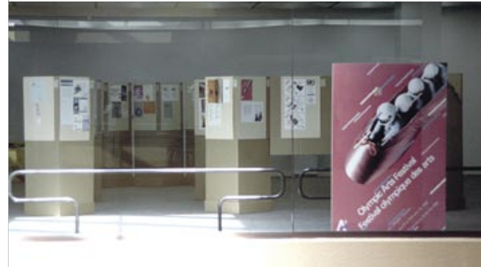
Shortly after the 1988 Olympic Winter Games in Calgary, I put together an exhibition of print material from the Olympic Arts Festival for Edmontonians to view. Few people here were aware of our design involvement, because the Calgary Organizing Committee did not want it known that an Edmonton design firm had won the contract!