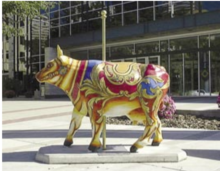
The Cow Project was a fund-raiser for the United Way. Artists and designers were invited to submit ideas for decorating fiberglass cows to be commissioned by sponsors. I made several submissions, three of which were sponsored — In-cow-nito, Cowrousel and Vincent VanCow.