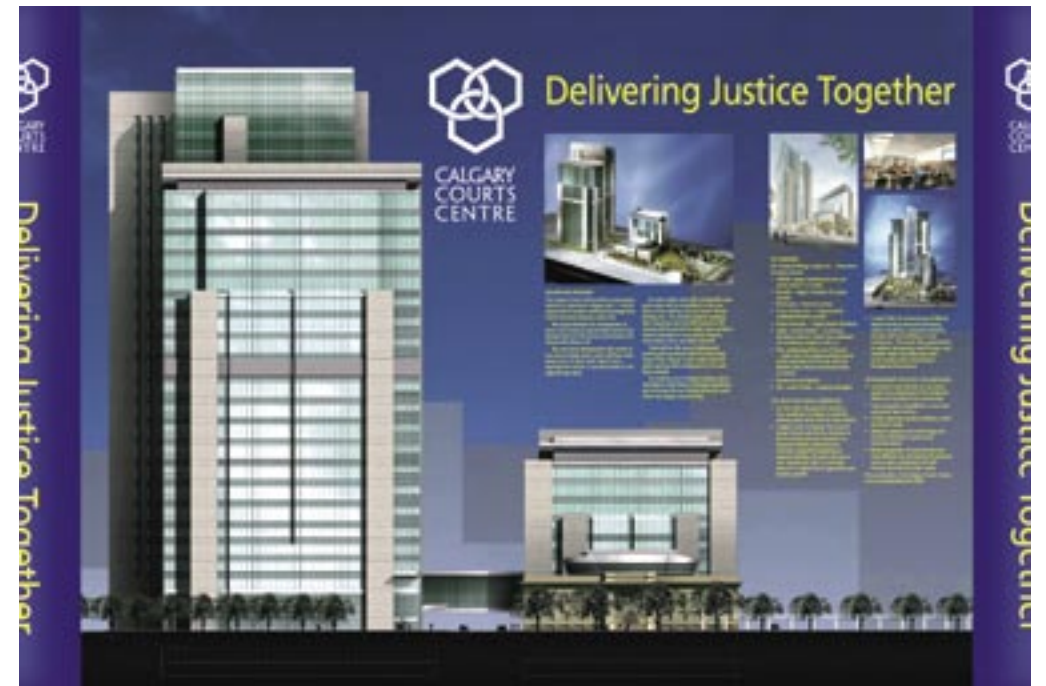
Display for a press conference announcing the Calgary Courts Centre project, result of a partnership of government and private interests.